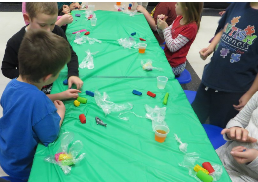
Craft time at the Cato-Meridian Club